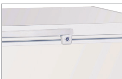
Chiave e serratura Lock and key

Congelatore statico a pozzo porta cieca battente. Static chest freezer with solid hinged lids.