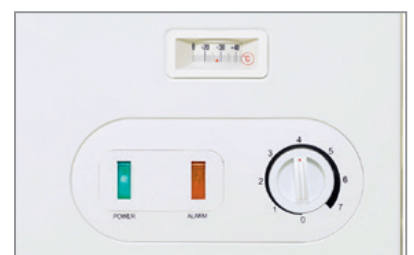
Termostato e termometro meccanico Mechanical thermostat and thermometer