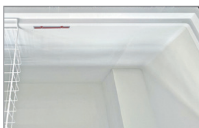
Interno lamiera preverniciata bianca White prepainted sheet innerliner

Congelatore statico a pozzo porta cieca sistema flip-flop. Static chest freezer with flip-flop lids.