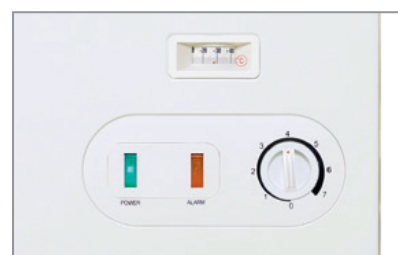
Termostato e termometro meccanico Mechanical thermostat and thermometer