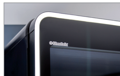
Luce led su contorno esterno Led bar front lighting round