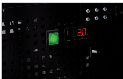
Termostato elettronico Electronic thermostat